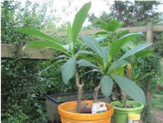
Propagation of Plumerias (Continued)