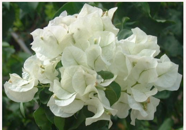
White Bougainvillea Plant

Potted Bougainvillea Plants: Tips For Growing Bougainvillea In Containers , Mary H. Dyer, Master Naturalist and Master Gardener, on “Gardening KnowHow” at link: https://www.gardeningknowhow.com/ornamental/vines/bougainvillea/bougainvillea-in-containers.htm?print=1&loc=top