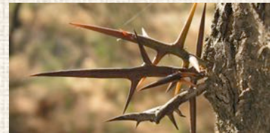
Honey Locust ( Gleditsia )

Pyracantha can grow 10 feet tall and nearly as wide. It's a hardy plant that endures plenty of abuse, and it can spread quickly. You'll need to be ready for battle if you hope to save your yard from this thorny beast.