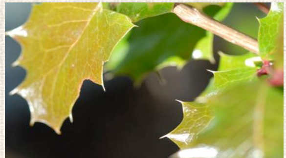
Oregon Grape ( Mahonia )

Nobody's climbing this tree, which can grow 60 to 90 feet tall, because the rough bark of the honey locust is often covered with 6-inch dagger-like thorns—it's the Michael Myers of plants. Botanists say the thorns evolved to protect the tree from giant sloths and short-faced bears that roamed North America thousands of years ago. Although these pre-historical fauna are no longer around, the flora's deadly defenses still are.