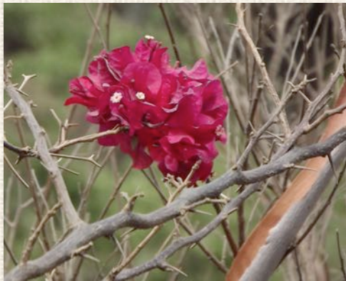
Bougainvillea ( Nyctaginaceae )

Think of this plant like a no non-sense rose, with no showy flowers and all canes and prickles. They're incredibly fast-growers and can quickly grow into a twisted biomass of hurt 5-foot-high, and this 'wall of pain' can be as wide as you'd like. Because of their tendency to grow quickly, you'll need to be a diligent pruner but hey, at least you get those berries.