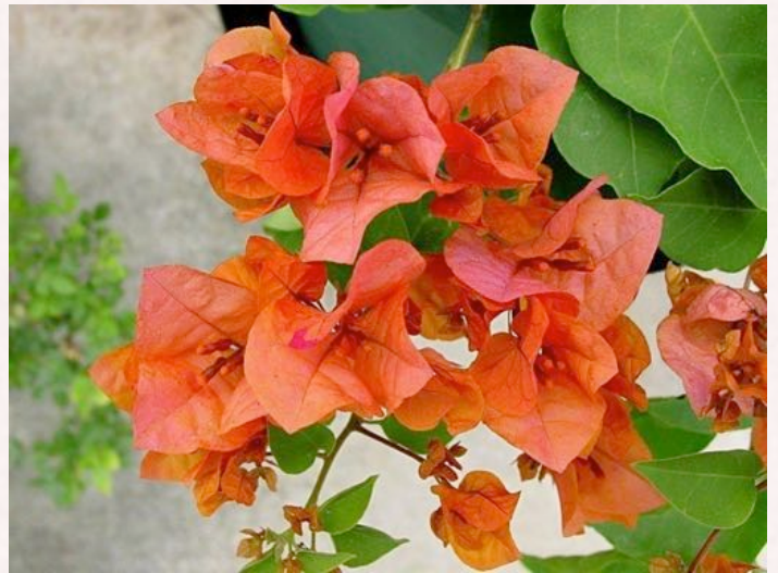
‘Alabama Sunset’ Bougainvillea