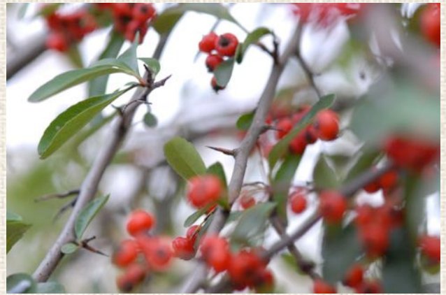
Firethorn ( Pyracantha )

This climbing shrub grows 3 to 5 feet high and sends heavily armed branches in every direction. It usually needs support and looks for other plants or a fence to hold it up. Crimson summer flowers are but a beautiful face in front of the insidious matrix of thorns beneath. And this plant is evil all the way through, as its sap will irritate skin and can be toxic if ever ingested. Though it you ever eat this thorny nightmare, you might experience some other problems as well.