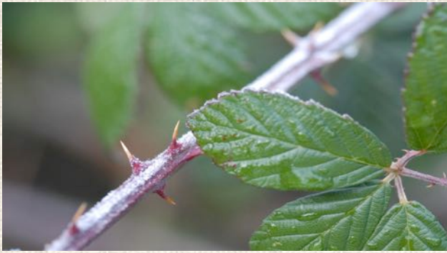
Blackberry ( Rosaceae )

Think of this plant like a no non-sense rose, with no showy flowers and all canes and prickles. They're incredibly fast-growers and can quickly grow into a twisted biomass of hurt 5-foot-high, and this 'wall of pain' can be as wide as you'd like. Because of their tendency to grow quickly, you'll need to be a diligent pruner but hey, at least you get those berries.