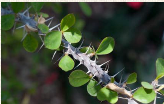
Crown of Thorns ( Euphorbia )

A fast-growing shrubby vine that can grow 40 feet long, Bougainvillea uses its thorny stems to support itself on nearby plants or structures. The colorful display is actually large, papery bracts that surround the tiny flowers, and you definitely don't want this plant's sap to touch your skin.