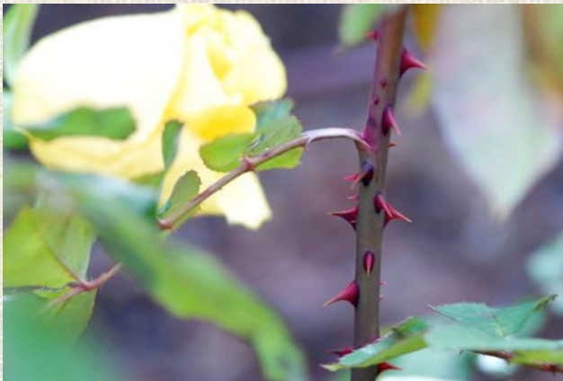
Rose ( Rosa )

It'd be hard to find a more aggressive-looking combo of leaves and stems than Solanum , aka Devil's Thorn, a hardy shrub that can grow 5 feet tall. Some species contain a toxic alkaloid that, if ingested, can cause serious sickness and even death. As if those spines weren't 'bad-ass' enough.