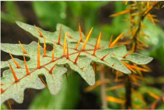
Porcupine Tomato ( Solanum )

It'd be hard to find a more aggressive-looking combo of leaves and stems than Solanum , aka Devil's Thorn, a hardy shrub that can grow 5 feet tall. Some species contain a toxic alkaloid that, if ingested, can cause serious sickness and even death. As if those spines weren't 'bad-ass' enough.